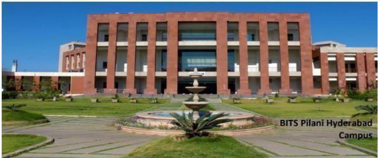
BITS Pilani Hyderabad Campus