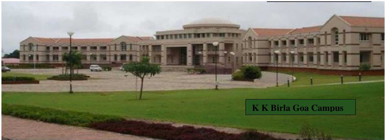
K K Birla Goa Campus